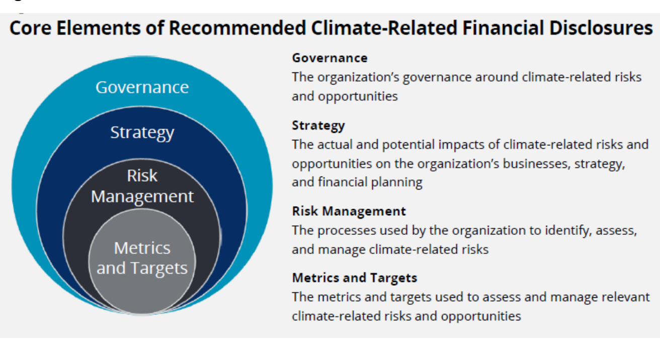
Figure 1: TCFD Disclosure Pillars

Staffordshire Pension Fund ('the Fund') supports the TCFD recommendations as the optimal framework to describe and communicate the steps the Fund is taking to manage climate-related risks and incorporate climate risk management into investment processes. As a Pension Fund we are long-term investors and are diversified across asset classes, regions and sectors, making us "universal owners". It is in our interest that the market is able to effectively price climate-related risks and that policy makers are able to address market failure. We believe TCFD-aligned disclosure from asset owners, asset managers, and corporates, is in the best interest of our beneficiaries.